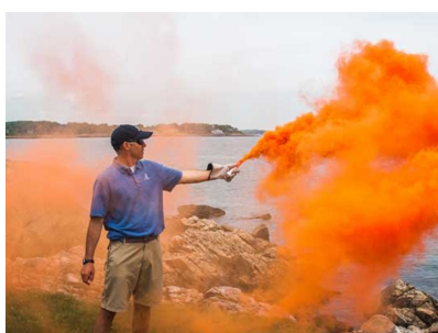
Orange Smoke Flare

Only use the following 2 types of flares (NB: no parachute types) not older than 6 years from date of manufacture: