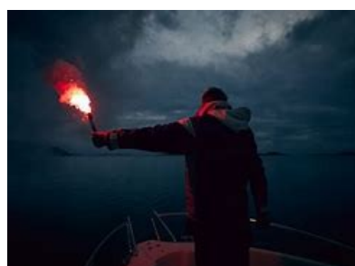
Red Distress Night Flare

Please ensure that you have the right personal protection gear: