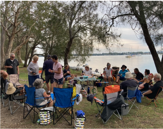
NY Day; Pittwater Cruise; Easter Cruise; Sunshine and Broughton Island Cruise....